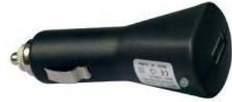
Car Adapter (Optional)