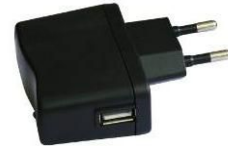
Europe AC Adapter (Optional)