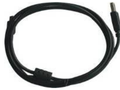
USB Charging Wire