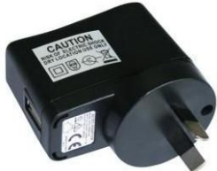
Australia AC Adapter (Optional)