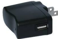
USA AC Adapter (Optional)